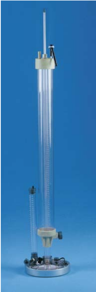
(Figure 1) - Guelph Permeameter Reservoir Assembly