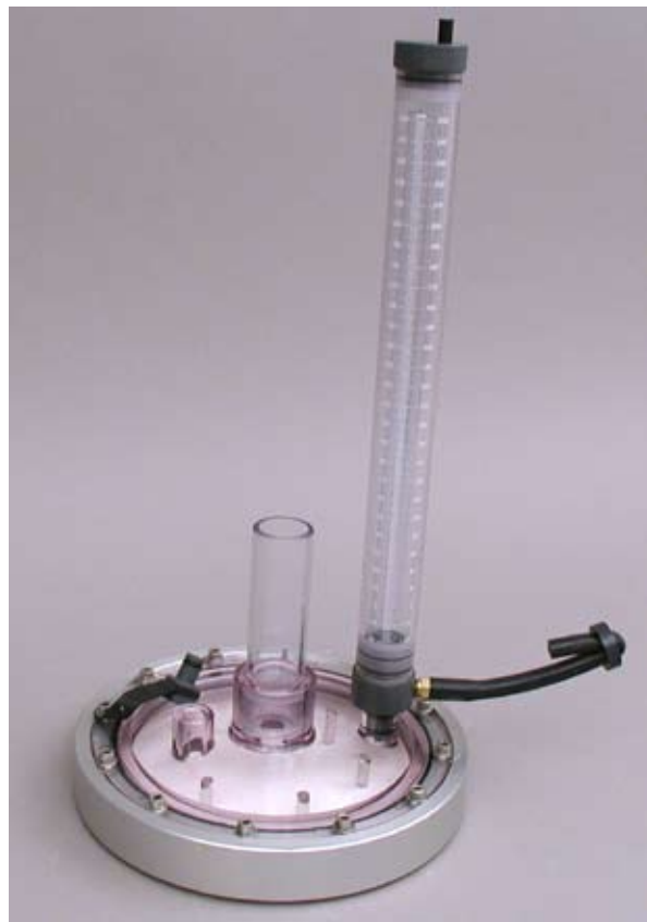
(Figure 2) - Infiltrometer Foot Assembly and Mariot Bubbler Assembly

The Tension Infiltrometer (TI) Attachments for the Guelph Permeameter (GP), consist of three major components: