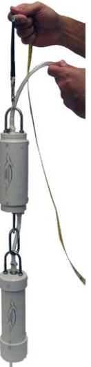
Aardvark permeameter module and pressure regulator